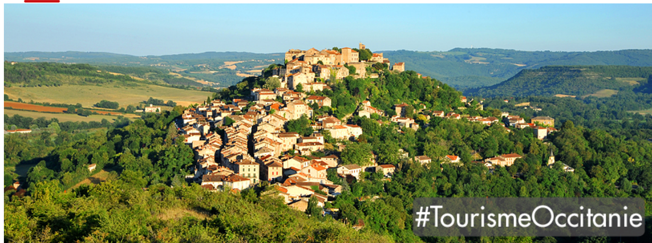
Cordes-sur-Ciel (Tarn / Occitanie)